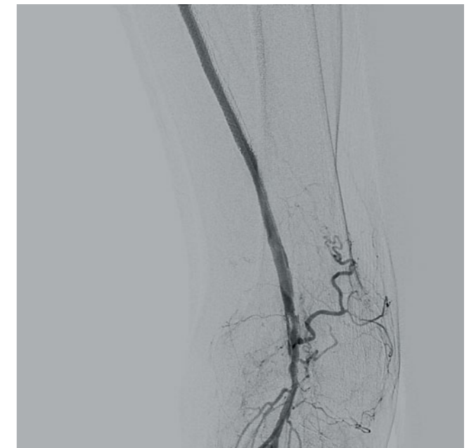
Post atherectomy of stent placement. Left superficial artery residual stenosis is 0%.