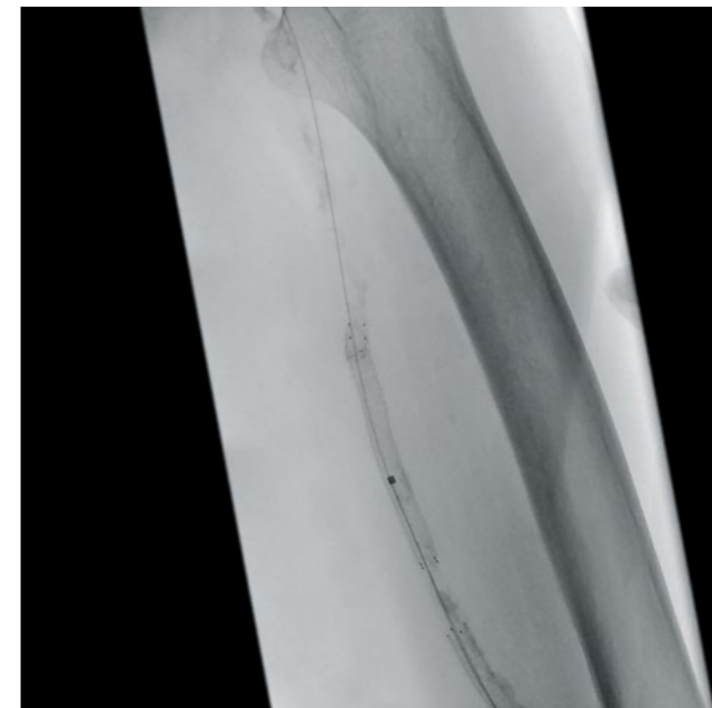
Laser atherectomy performed in-stent restenosis