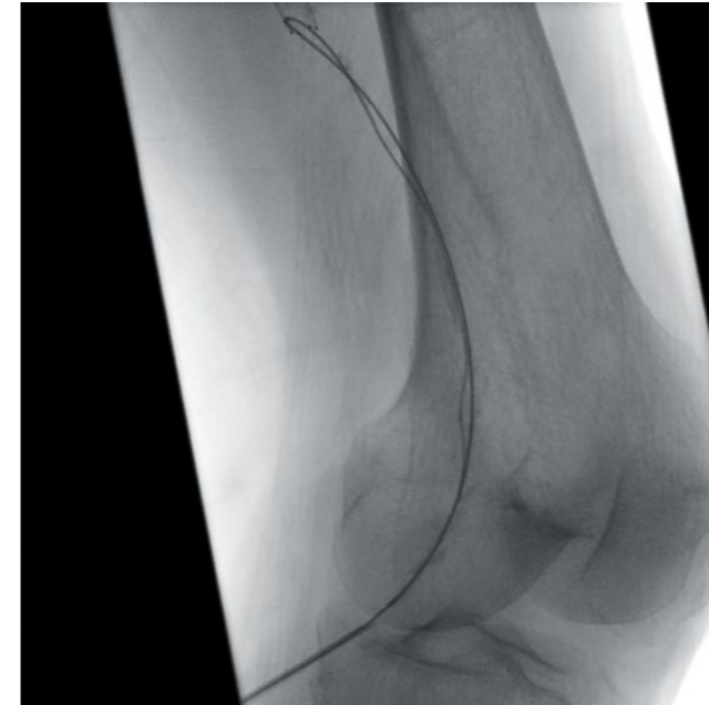
Popliteal artery access under ultrasound, chronic total occlusion crossed through previously placed stents with guide wire

At the end of the procedure the patient had palpable 2+ pulses in the dorsalis pedis artery. In the recovery room, the patient stated she had complete relief from the pain in her lower left extremity.